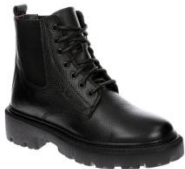
Women's sports boots code 423