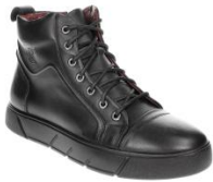
Men's Boots Code 206